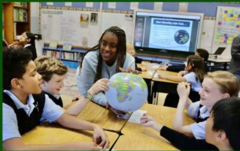
Science, Technology and Engineering Initiatives