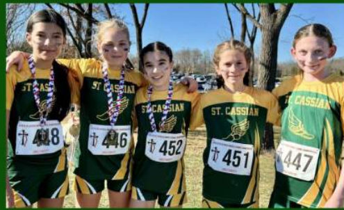
Sports Equipment Upgrades