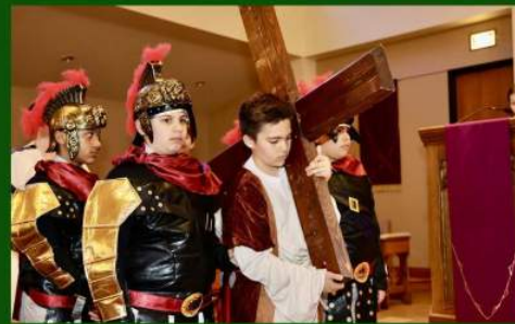
Religious Education Materials for CCD and Saint Cassian students.