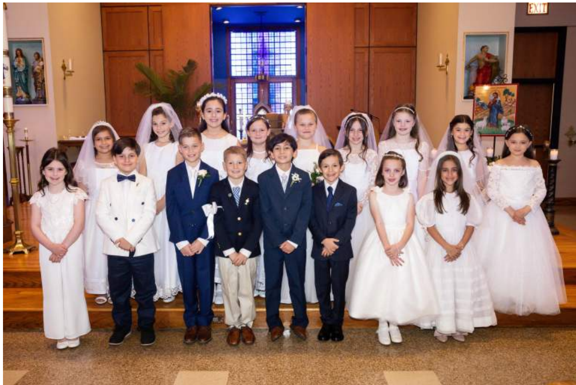
April 28th First Holy Communion Class