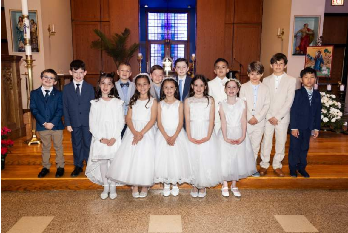
April 27th First Holy Communion Class