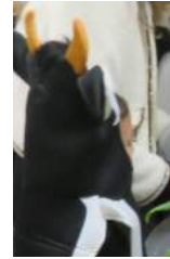
Shepherds, Inn keeper, Angels, St. Joseph ,a Wise man and a cow getting dressed. (Left to Right )