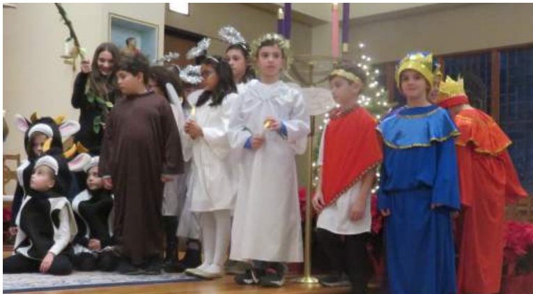
Cows, Innkeeper, Angels, Wise Men