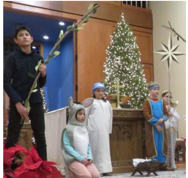
Donkey, Blessed Mother, St. Joseph, Star angel