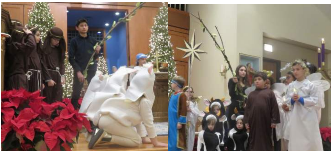
Shepherds, Sheep, Blessed Mother, St. Joseph, Star Angel, Cows, Innkeeper, and Angels